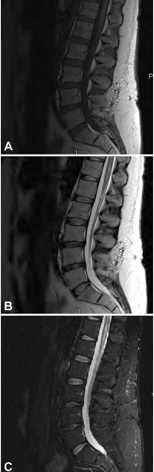
Fig. 2. Magnetic resonance images (about 48 hours after the procedure) showing extensive signal abnormalities within the lower thoracic spinal cord and conus compatible with the clinical diagnosis of conus infarct. (A) T1-weighted sagittal image (repetition time, 675.0; echo time, 9.6). (B) T2-weighted sagittal image (repetition time, 3640.0; echo time, 102.0). (C) Short tau inversion recovery (STIR) sagittal image (repetition time, 4000.0; echo time, 58.0).

urge sensation had returned, and occasional episodes of fecal incontinence occurred in relation to bladder overdistention. He was able to have an erection but could not achieve orgasm.