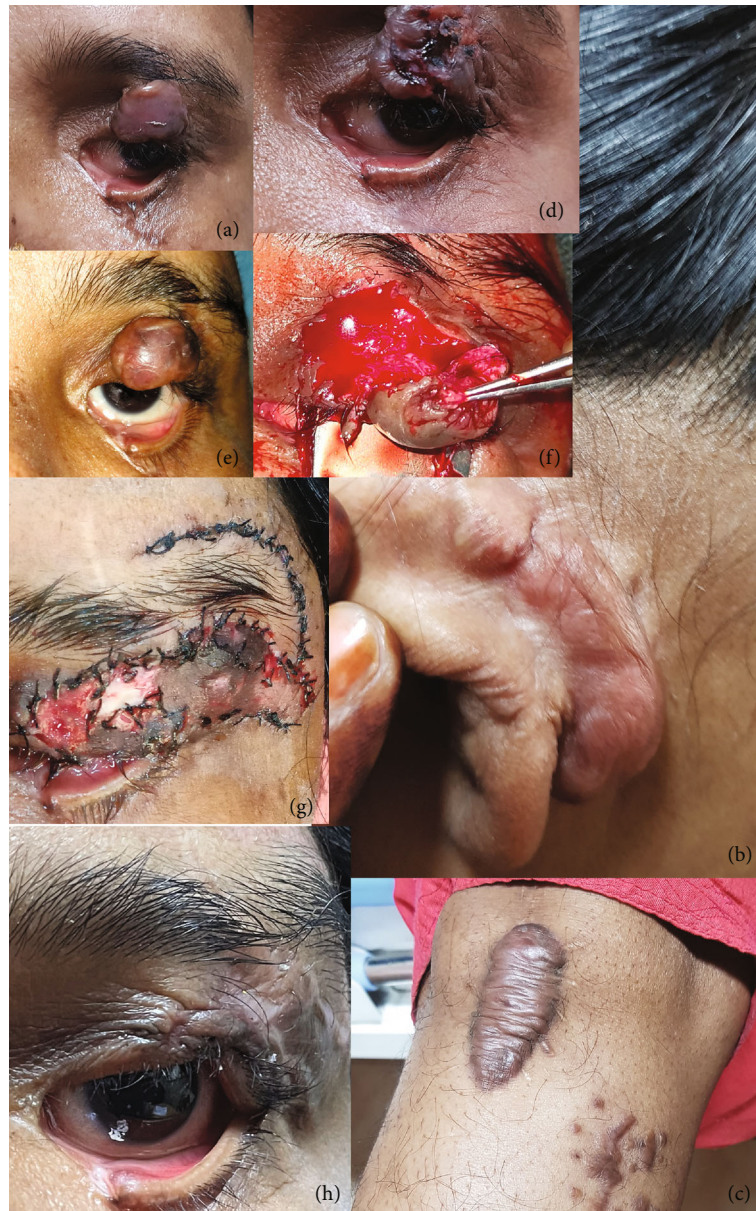
FIGURE 1: (a) A well-defined mass seen on the left upper lid (1.5 cm × 1.2 cm × 1 cm) involving the lid margin. (b) Thickened mass seen in the postauricular area. (c) Hyperpigmented lesions seen on the right leg. (d) Ulceration of keloid surface following intralesional 5-FU (50 mg/mL) and crystalline TAC (40 mg/mL) injection. (e) Regrowth of keloid after discontinuation of 5-FU (50 mg/mL) and crystalline TAC (40 mg/mL) injection. (f) Excision of keloid. (g) Development of postsurgical wound infection. (h) Clinical appearance after 16 months of upper lid keloid excision.

surgery, she started having itching, redness, and thickening of the left upper lid and postauricular region.