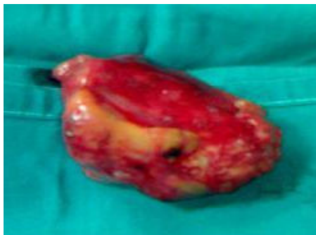
Figure 2 Thymoma after removed from the anterior perivisceral pleura of the left lung.

The thymus gland is an anterior mediastinal structure arising embryologically from the third, and to a lesser extent, the fourth pharyngeal pouch. A prominent organ early in life, the thymus reaches a maximum size of 40 g during puberty before regressing and involuting during adulthood, being replaced by fibro-fatty tissue [1]. Thymoma is an uncommon neoplasm that derives from the epithelial cells of thymus and it is the most common neoplasm of