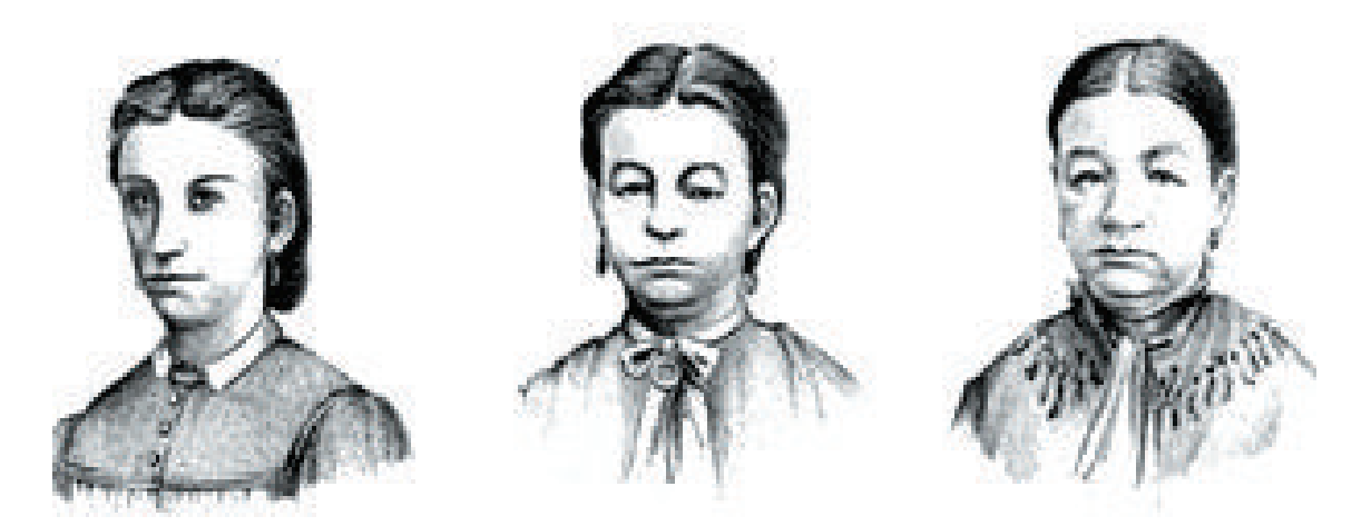
FIGURE 1: First photo of a patient with myxedema. From Ord (1878). (a) Patient at the age of 21—before onset of symptoms. (b) Seven years later. (c) Four years later.