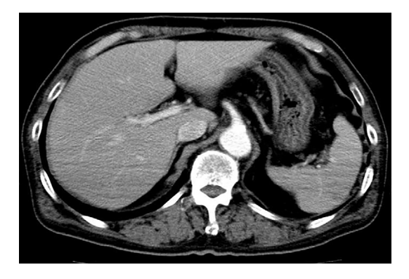
Figure 1. On contrast abdominal computed tomography, the liver and spleen were normal in size and shape.

stage IVA and at high risk, according to the revised international prognostic index (R-IPI). His laboratory findings were negative for HBsAg [chemiluminescence enzyme immunoassay (CLEIA)] and anti-HBs (CLEIA) and positive for anti-HBc (CLEIA). His serum levels of HBV-DNA [real-time polymerase chain reaction (RT-PCR)] were 2.6 log copies/ mL. Computed tomography showed a normal liver (Fig. 1). Therefore, he was also diagnosed with OBI. Entecavir (ETV) was instituted for the prevention of HBV reactivation due to chemotherapy. We performed R-THP-COP therapy [rituximab 375 mg/m<sup>2</sup> (610 mg/body), cyclophosphamide 460 mg/m<sup>2</sup> (750 mg/body), doxorubicin 30 mg/m<sup>2</sup> (50 mg/ body), vincristine 0.9 mg/m^2 (1.4 mg/body) and prednisolone 1.0 mg/kg (60 mg/body)] with intrathecal administration (methotrexate 10 mg, predonisolone 20 mg and cytarabine 20 mg). R-THP-COP therapy was performed every 4 weeks, 6 times in total, 2 sessions of which were intrathecal administrations (Fig. 2). He achieved complete remission with chemotherapy at five months. During the period of chemotherapy, his serum levels of HBV-DNA remained undetectable.