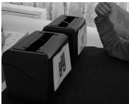
Figure 1. Set up for executive function test.