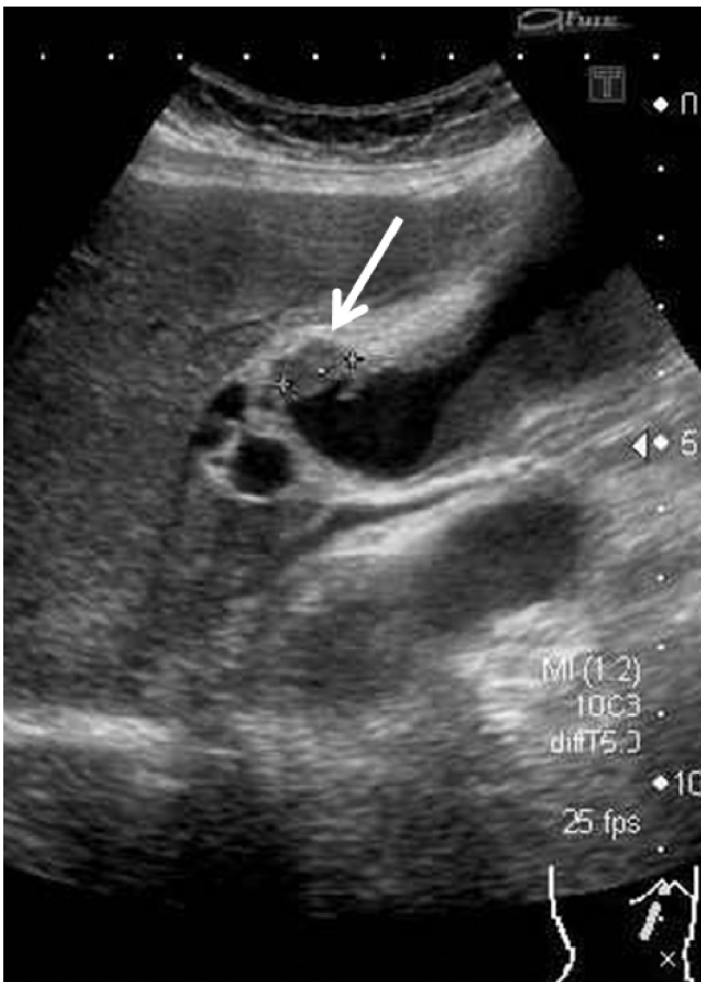
Fig. 2. Ultrasonography also showed a tumor of 10 mm in diameter in the cystic duct.