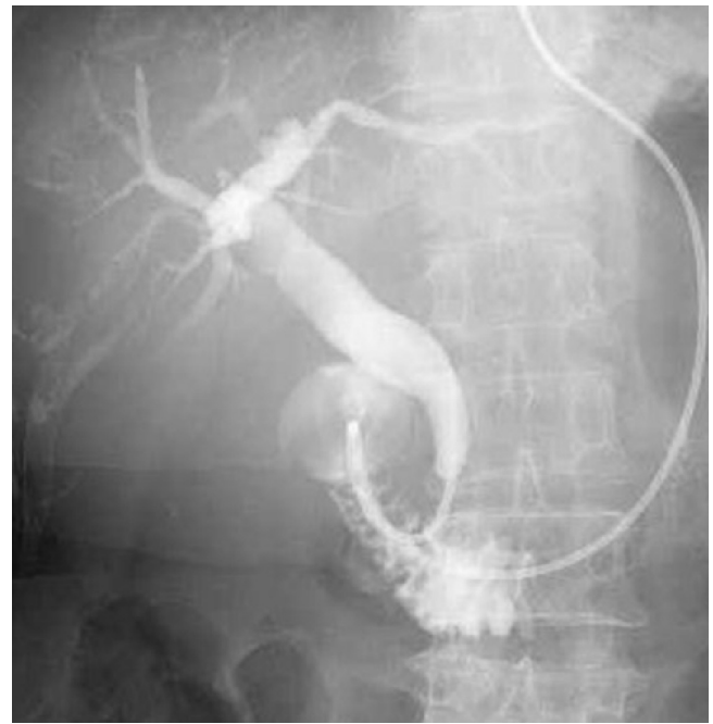
Fig. 3. Endoscopic retrograde cholangiopancreatography showed an obstruction of the cystic duct.