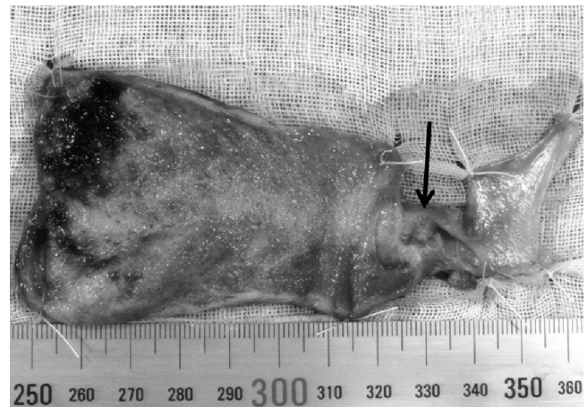
Fig. 4. The surgically resected specimen comprised a 6.0 mm × 5.0-mm nodular infiltrating tumor (arrow) surrounded by a shallow ulcer, 11 mm × 10 mm in diameter, restricted to the cystic duct.

invasion to adjacent organs was detected on chest and abdominal CT scans. We then performed cholecystectomy, extrahepatic bile duct resection and regional lymph node dissection (D2) followed by hepaticojejunostomy.