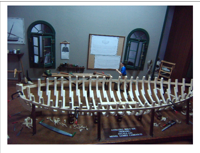
FIGURE 4 | Highly detailed boatyard model.

TABLE 2 | Impulse control disorders and dopaminergic creativity short review and hypothesis.