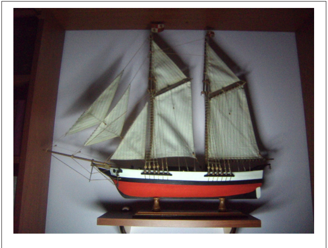
FIGURE 3 | Ship modeling (Schooner), another classic from our patients.