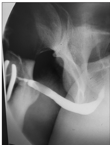
Figure 1: Urethrogram showing penile stricture after failed hypospadias repair

Objective clinical parameters such as age, clinical history, previous events of dilatation, urethrotomy and urethroplasty, uroflowmetry, ultrasonography, retrograde and voiding cystography were collected for each patient. Clinical failure was considered when any postoperative instrumentation, including dilation, was needed. Uroflowmetry and urine culture were repeated every 6 months in the first 2 years and annually thereafter. When symptoms of reduced flow were present and uroflowmetry was <12 ml/s, meatal calibration, urethrography, urethral ultrasound, and urethroscopy were done to evaluate the cause of failure. The primary outcome of the study was to compare the postoperative stricture-free rate and minimizing need for multiple surgeries.