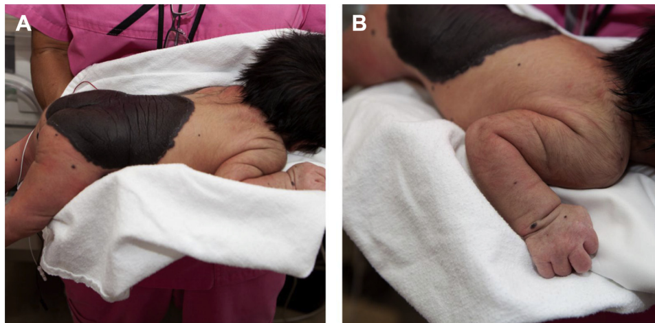
Fig. 1 – Congenital giant nevi on the back of a term baby, with dominant “cape-like” lesion on his back and buttocks (A), and multiple surrounding small lesions extending to both upper and lower extremities (B).

enhancement. Given the presence of the giant nevi, the provisional diagnosis of neurocutaneous melanosis (NCM) was established.