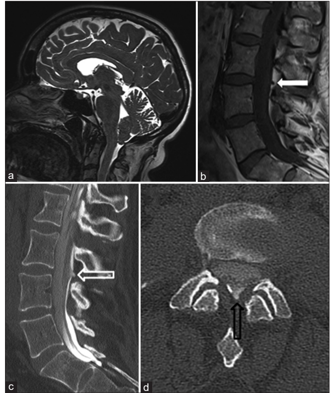
Figure 1: (a) Sagittal T2W MRI scan showing tonsillar descent with effacement of cisterna magna. (b) Sagittal T1W MRI reported as normal but reveals dural defect (white arrow) at L3/4. (c) Sagittal CT myelogram showing a posterior dural outpouching at L3/4 (hollow white arrow). (d) Axial CT myelogram view of same central dural defect at L3/4 (hollow black arrow).

A further exploration occurred. Intraoperatively, CSF was seen leaking around the previous stitches. All the sutures were removed and the arachnoid reopened. The dural defect was extended and then closed with continuous 5/0 Prolene®. A small piece of muscle was crushed and placed on the suture line. A lumbar drain was inserted in an adjacent segment for