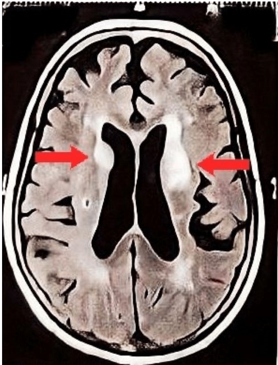
FIGURE 3: T2W MRI with contrast in Case 3 showing atrophy and microvascular ischemic changes; hyperintensity in bilateral basal ganglia regions suggestive of infarct (red arrow).