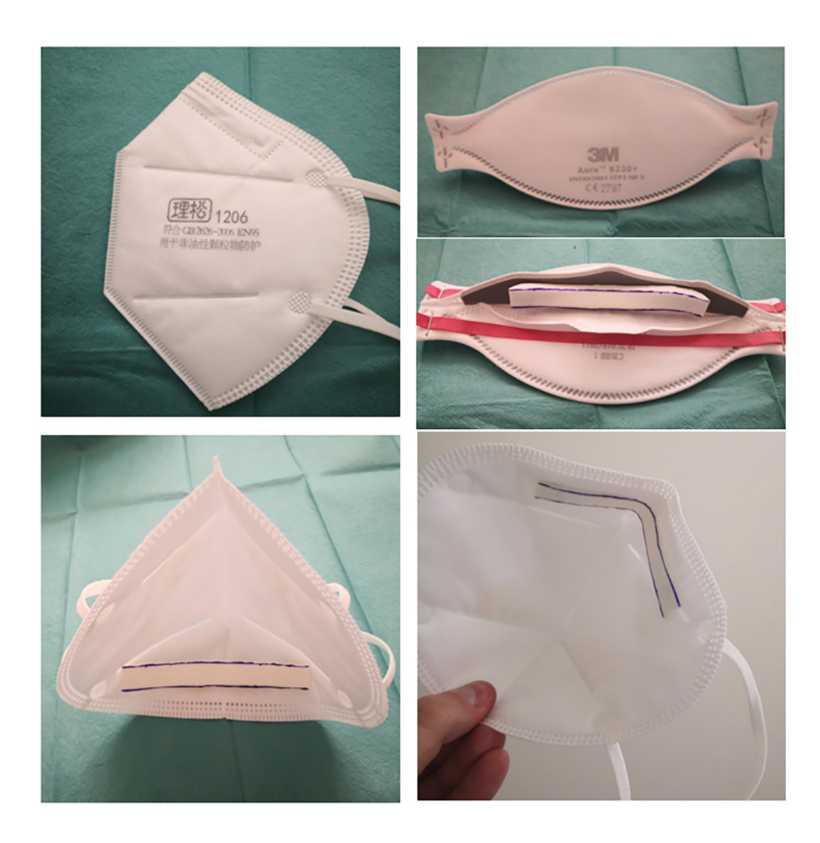
Figure 3. Polyurethane foam modulation for masks