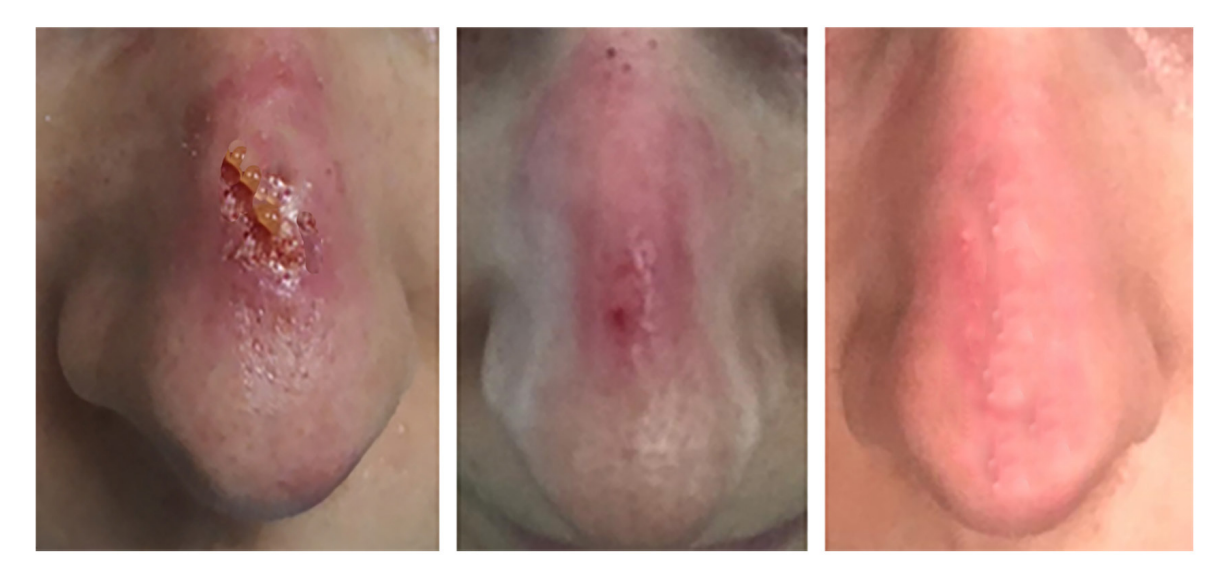
Figure 4. Evolution of grade 2 nasal bridge ulcer. From the left: time 0, one week, two weeks.

Grade 4: exposition of deep structures (fascia, muscle, cartilage, bone, etc).