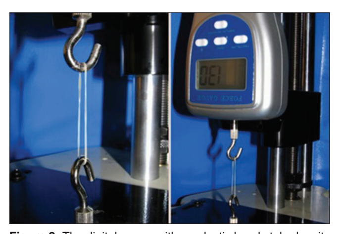
Figure 2: The digital gauge with an elastic band staked on its hooks. The magnitude of the required force F is measured.

Means and standard deviation of the force values generated by each group of elastics when stretched to 25 mm are shown in Table 1. RMANOVA showed a significant interaction effect between time and group (P = 0.014). Therefore, the changes