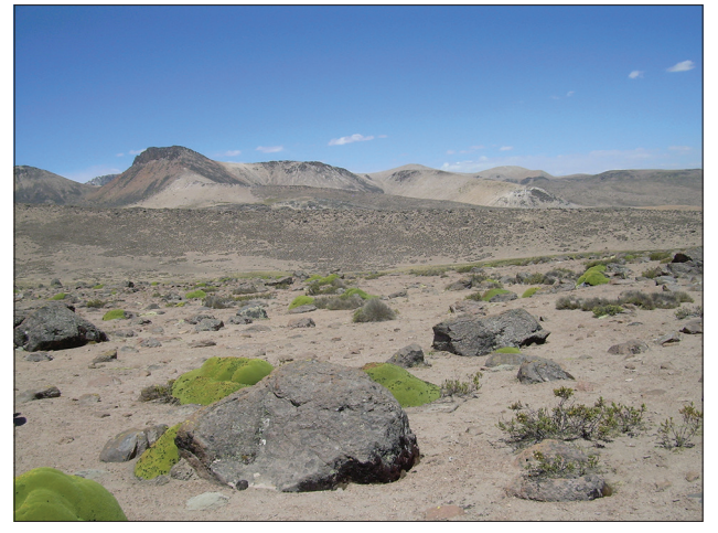
Figure 1: Photograph of A. compacta from Patapampa Perú

The aerial parts of A. compacta (400 g) were extracted with DCM (2 l) three times for 7 days. The concentrated DCM extract (10.5 g) was submitted to an open silica gel column ( 10 \times 70 cm) using n -hexane/EtOAc mixtures (100:0 to 0:100% v/v) to give five fractions. Fraction 1 (100% n -hexane; 950 mg) was subjected on a Sephadex LH-20 column ( 7 \times 70 cm, n -hexane: DCM: MeOH; 3:1:1 v/v/v) followed by silicagel column chromatography ( 4 \times 50 cm) using as mobile phase only n -hexane to afford 1 (20 mg).