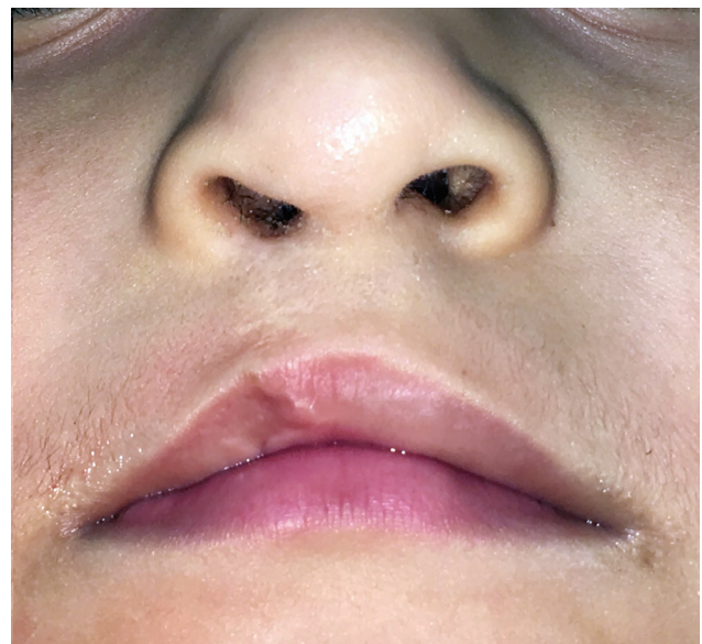
Fig. 4. Postoperative front view of the patient after surgery, illustrating cosmetic improvement of the lip and nose using the proposed method after 5 years.

planned and the relevant areas be measured before performing a repair to prevent non-desirable outcomes.