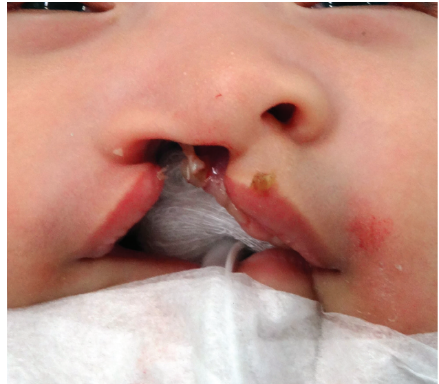
Fig. 3. Preoperative view of a 3-months-old patient with severe unilateral cleft lip deformity (discrepancy between cleft and non-cleft side lip height is 8 mm).

The main advantages of this innovative technique are preservation of lip tissues, improvement of lateral segment deficiency, and use of similar tissues for lip and nose repair. A limitation of the triple unilimb Z plasty technique would be the difficulty for secondary repair due to the multiple scars. For these reasons, the technique must be carefully