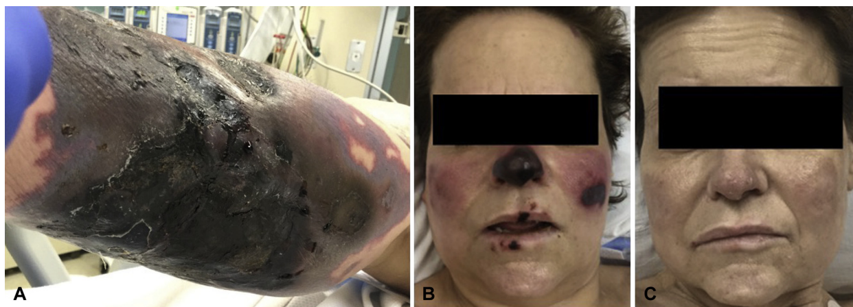
Fig 1. Levamisole-induced vasculitis causing necrotic wounds on the bilateral and upper extremities lower ( A , right lower-extremity), nasal tip, left cheek, lips ( B ), ears, and anterior aspect of the trunk. The patient's facial wounds healed well after treatment ( C ).

surgery. Patient 3 was also found to have P aeruginosa bacteremia from her infected wounds. This bacteremia was detected after her seventh surgery, which consisted of wound bed preparation of her BLE wounds and bilateral wound VAC placement.