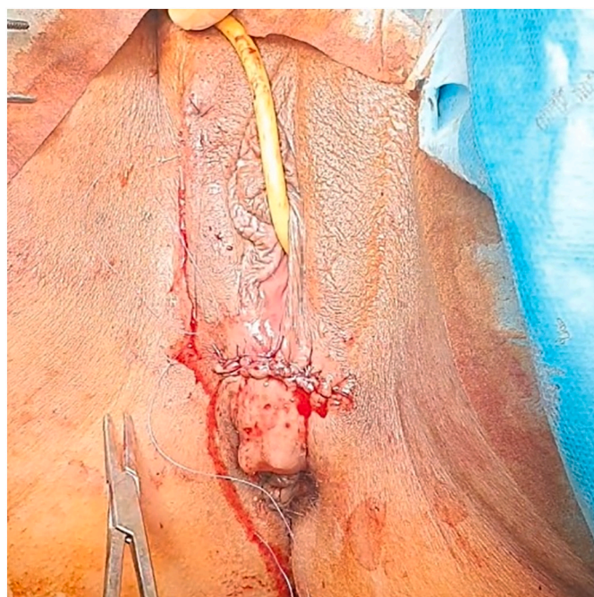
Fig. 3. The final aspect of the patient after perineal and labial majora incisions suture.

presentation and the causes of the fistula. The results obtained vary according to the series from 30 to 90% according to the clinical forms and the surgical technique used. According to Byrnes, the rates of recurrence after the initial surgical repair of the RVF are high and do not differ according to the type of procedure or by subspecialty of the patient. This case shows the possibility of complication of Bartholin's gland abscess resulting in rectovaginal fistula and the efficacy of Martius flap in treatment of recurrent RVF of the lower third part of the vagina.