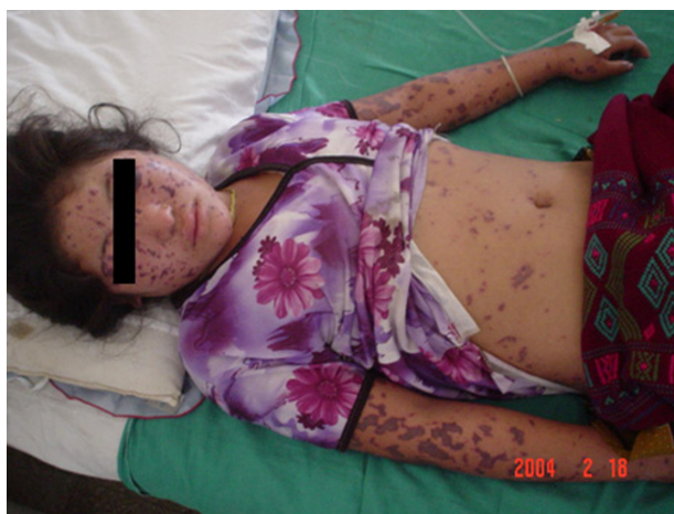
Figure 1 Purpuric rash of meningococemia at presentation. Shrestha NK. Infectious disease emergencies. In: Carey WD, editor. Current Clinical Medicine , 2nd ed. Philadelphia, PA: Saunders Elsevier; 2010:706. 17

Considering local sensitivity patterns, the patient was treated with 2 g intravenous (IV) ceftriaxone every 12 hours. Over the next few days, she developed shortness of breath and worsening edema. Fever persisted and the patient remained bedridden with severe malaise. On the sixth day of hospitalization, she was noted to have anasarca, an elevated jugular venous pulse, shock with blood pressure of 80/40 mmHg,