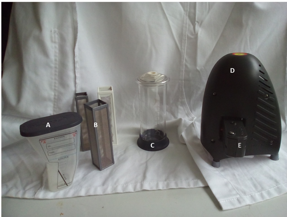
Figure 1. The supplied FECPAK G2 equipment. A: Sedimentor; B: 1 mm white pre-filter and 600 and 425 µm silver filters; C: filter cylinder; D: Micro-I imaging device; E: FECPAK G2 cassette, inserted into Micro-I.

Figure 1 shows the equipment used for the FECPAK G2 system as described below.