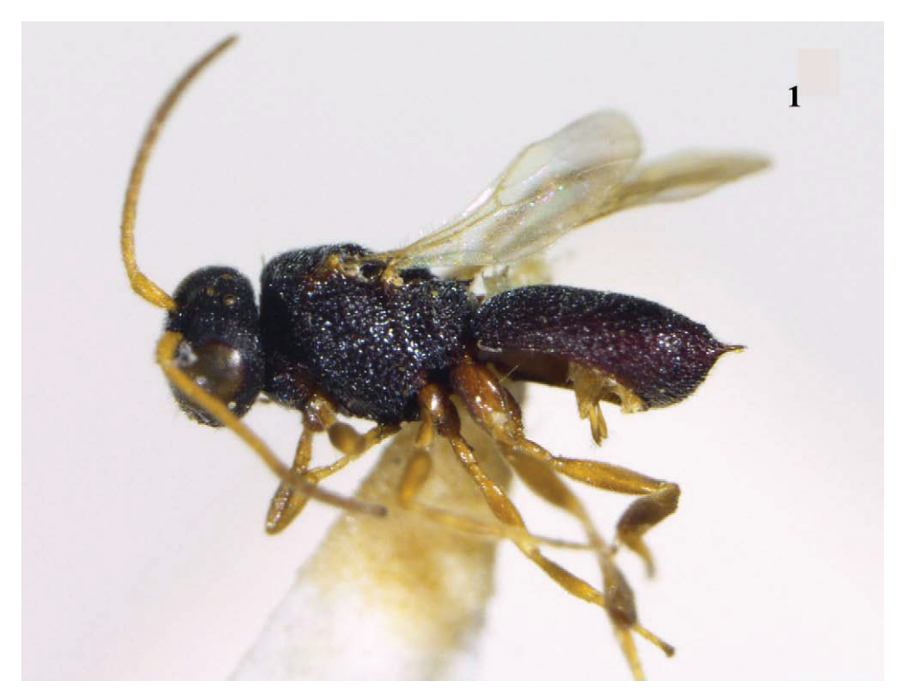
Figure 1. Chelonus spinigaster sp. n., female, holotype, habitus, lateral aspect.

Legs : Hind femur 3.3 \times as long as broad, 0.8 \times as long as hind tibia, hind tibia 1.3 \times as long wide and 1.3 \times longer than hind tarsus.