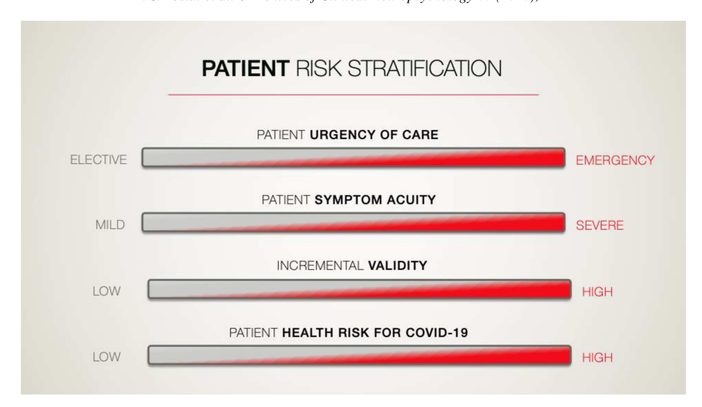
Fig. 1. Patient risk stratification.

testing, where the primary referral question is whether continued reading intervention is necessary, a clinician might conclude that repeating a reading assessment adds considerable incremental validity to the most pressing aspect of the referral question but that repeating the rest of the battery might be delayed until extended face-to-face assessment is safer.