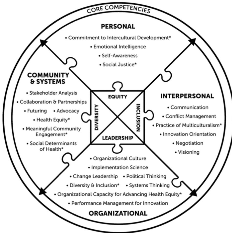
Figure 1 Core competencies and competency domains of clinical scholars program

result of the training they attended where they learned about said item. Evaluative comparisons of the two designs have shown that a retrospective pre-test method can be used to control for the response shift bias. This design asks the participant to self-rate items at a single timepoint but reflect back on the “pre-training” time.