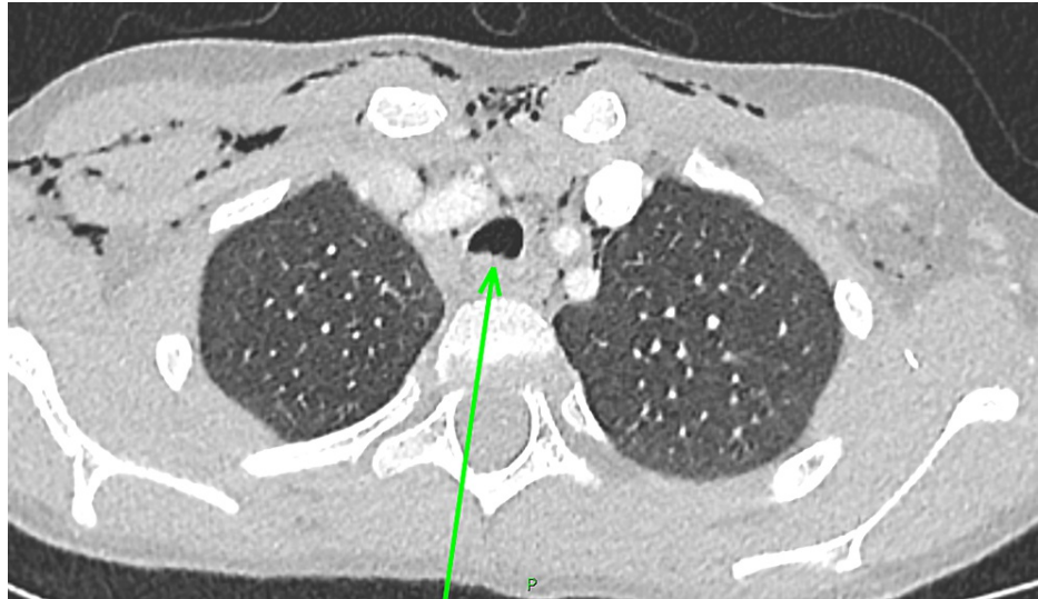
FIGURE 3: A follow-up CT of the neck and thorax (axial plane) revealing a healing tracheal laceration (green arrow).