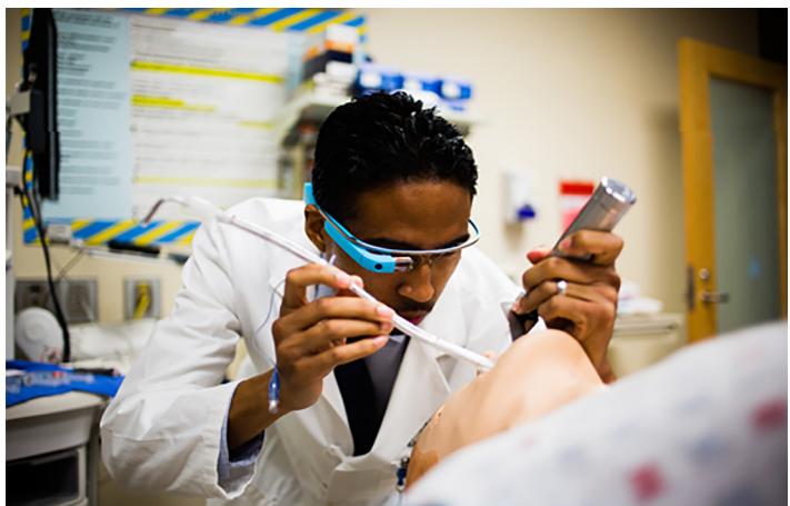
Figure 2A. Healthcare provider using wearable technology (Google Glass) while performing advanced airway procedure.

live interactive training session, virtual simulation component, and question/answer sessions occurred over a two-hour time period (Figure 1). A MCI scenario was created and staged at the broadcasting institution simulation center using a combination of live standardized patients and high-fidelity simulation mannequins. We used the software platform EyeSight (Pristine Eyesight, Austin, Texas) for the live interactive MCI practical application training session. EyeSight allows real-time audio and video collaboration via smart glasses (Google Glass, Mountain View, California) and mobile devices (Figure 2A).