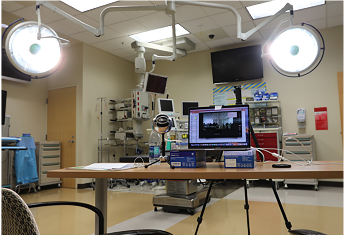
Figure 2B. Broadcasting institution location with laptop showing live feed to classroom at receiving location. Instructors at broadcasting institution were able to communicate live to students and instructors overseas via Google Glass, laptop, desktop, and wall-mounted TV monitors.