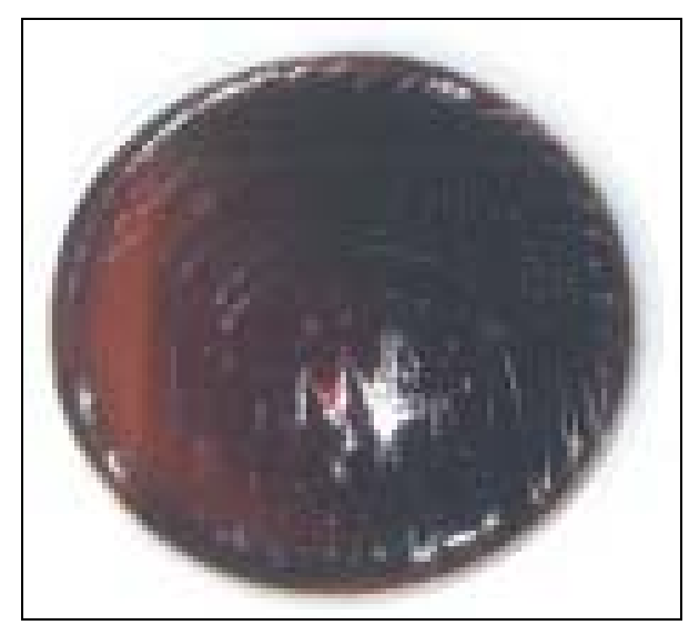
Figure 1. Growth of enterococci as black colonies on kanamycin Aesculin Azide agar.

To assess the VRE isolates among 265 outpatients and hospitalized patients, fecal samples were cultured in kanamycin Aesculin Azide agar. The enterococci were grown in black colonies (Figure 1). The biochemical tests indicated that among all samples, 100 VRE isolates ( \sim 38%) were obtained. The E. faecalis and E. faecium isolates were presented in 91 (91%) and 9 (9%) cases, respectively.