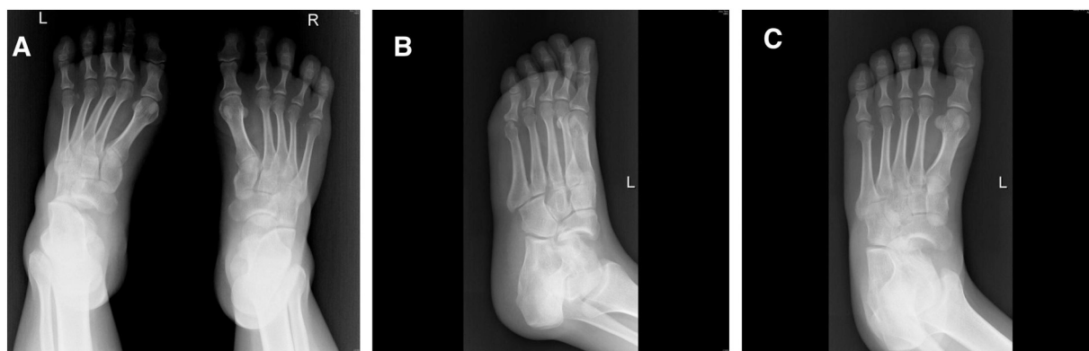
Fig. 1. A, B and C: X-ray of left foot (AP, Oblique, and standing views) showing medial dislocation of navicular.