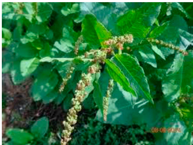
Figure 1 Photograph of leaves of R. nepalensis taken from “Sheka” forestry region, Ethiopia during sample collection, November 2018.

Tepi University reports the use of the plant as an abortifacient by “Shakicho” people.