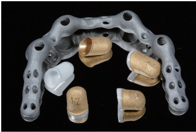
Fig. 1. Components of the CGDC restoration: milled and polished primary zirconia crowns, electroplated secondary crowns, and cast framework.

fracture rates and therefore was later replaced with yttria-stabilized zirconia polycrystals (Y-TZP or zirconia). 15 Subsequently, conical crowns with zirconia primary crowns and electroplated copings as female parts have been evaluated in several in vitro studies. 16-18 The CGDCs demonstrated clinically acceptable mean retentive forces and reduced excursive retentive force development compared with cast double crown systems. 17,18 The retentive force was influenced by the abutment height and the taper. It was concluded that zirconia primary crowns with a sufficient height and 2° taper can serve as an alternative to gold alloy primary crowns. 16