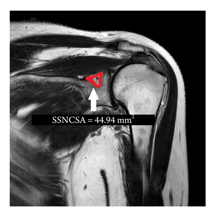
Fig. 1. Measurement of the SSNCSA (white arrow) was acquired via magnetic resonance T2 weighted images. SSNCSA: suprascapular notch cross-sectional area.

Demographic characteristics were not significantly different