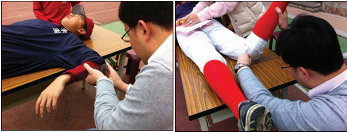
Figure 1. Measurement of shoulder and hip external/internal rotation.

impact from GIRD to the anterior cruciate ligament. We were not able to directly identify the relationship between GIRD and ACL in this study, but we would like to explore the potential injury mechanism of pitchers' knee. The purpose of this study is to observe the difference in the angular movement between the femur and the tibia of the leading leg between pitchers with GIRD and without GIRD.