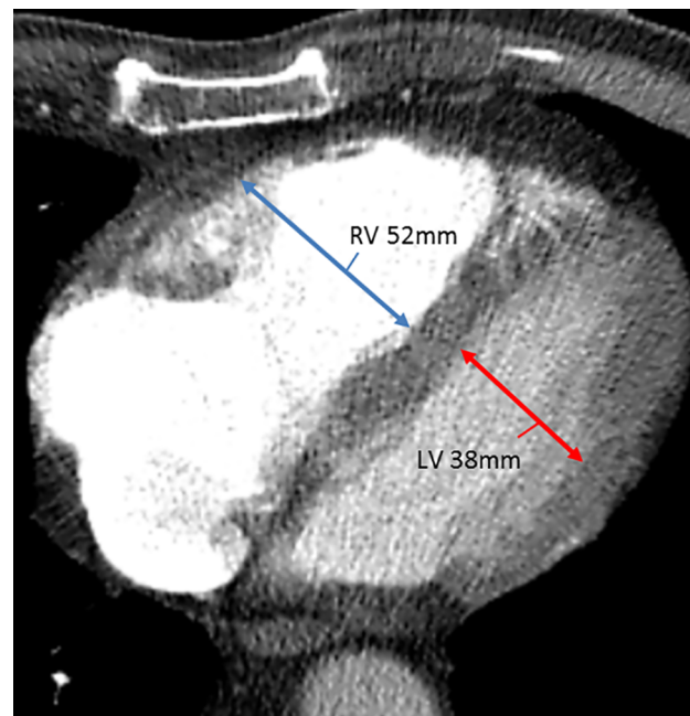
Fig 1. CTPA demonstrating the RV/LV ratio measurement. Note: CTPA: computed tomography pulmonary angiography; RV/LV: right-to left ventricle diameter ratio in this patient was 1.4.

Based on previous studies on this subject, we set our sample size at 100 CTPAs [12–15]. Baseline characteristics of the patients are provided with corresponding frequencies. Interobserver