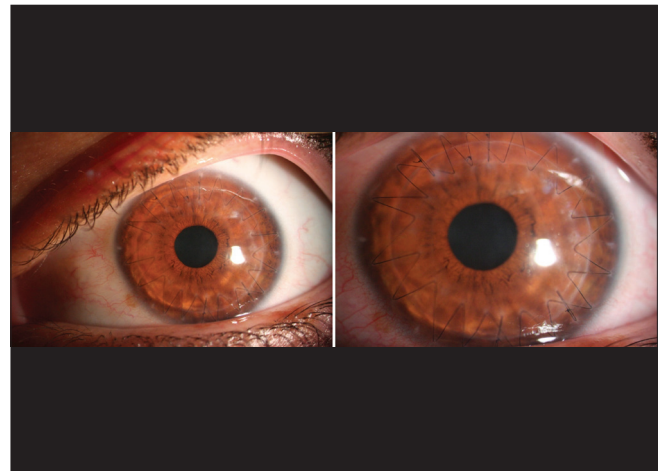
Figure 2: Modified DALK in a patient with steep curvature showing no evidence of postoperative Descemet's membrane wrinkling and folding