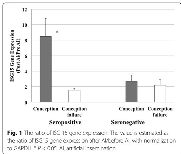
Fig. 1 The ratio of ISG 15 gene expression. The value is estimated as the ratio of ISG15 gene expression after AI/before AI, with normalization to GAPDH. * P < 0.05 . AI, artificial insemination

ISG15 is produced from the mononuclear cells in the mother in response to stimulation by IFN- \tau . The IFN- \tau has also been observed to influence Mx2 gene expression, and the expressions of both ISG15 and Mx2 have been reported during the early stages of pregnancy [13, 15, 22]. In the BoDV-1 infected group, a significant increase in ISG15 and Mx2 expression levels was observed after conception; however, the gene expression levels only slightly increased in the BoDV-1 uninfected group. The cows infected with BoDV-1 tended to increase IFN- \tau production and/or a higher response to IFN- \tau during pregnancy. The secretion of IFN- \tau is regulated by exsosome, endogenous jaagsiekte retroviruses in ovine [23]. BoDV-1 infection may affect on the IFN-tau expression in the embryo. The relatively higher expression of IFN- \tau may be essential for ensuring stable pregnancy, and the anti-viral effect of type 1 IFN might contribute to the maintenance of pregnancy