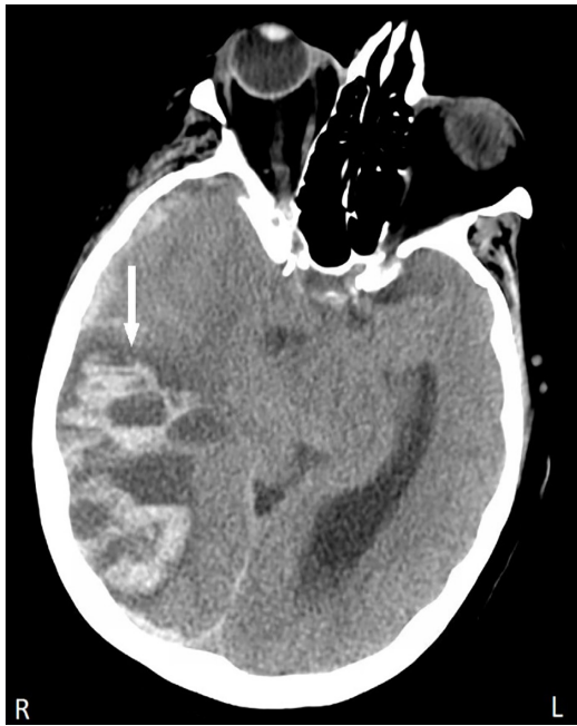
Image 1. Axial view of noncontrast computed tomography of the brain depicting a large right-sided parietal/temporal/occipital hemorrhage (arrow) with right-to-left midline shift in a 64-year-old female with history of non-small-cell lung cancer following initiation of therapeutic heparin anticoagulation for treatment of deep venous thrombosis.