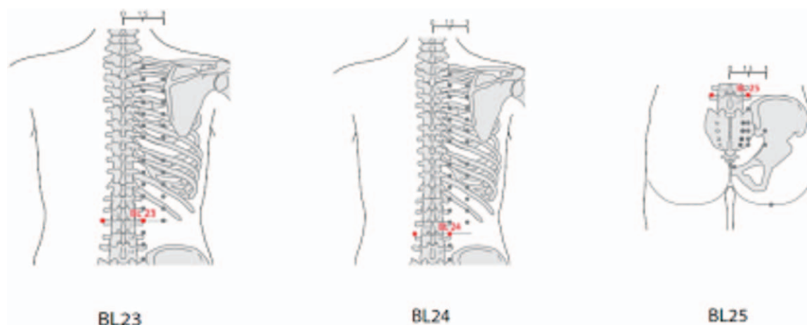
Figure 2. Location of acupoints used for treatment of chronic low back pain.

The primary and secondary outcomes will be based on the VAS score for pain and the Oswestry Disability Index (ODI). The VAS has been shown to be a reliable tool for evaluating chronic pain. [13] VAS for pain is a continuous scale with a horizontal or vertical line measuring 100 mm in length. [14] Patients rate their current pain intensity from 0 (no pain) to 100 (worst pain imaginable). [15] ODI was developed as a patient-oriented assessment tool and includes various questions that are answered