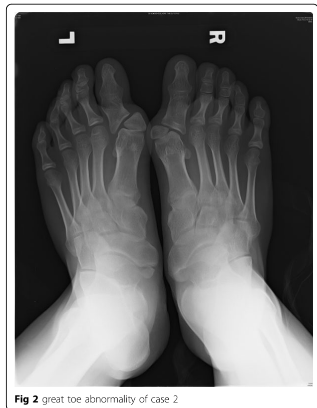
Fig 2 great toe abnormality of case 2