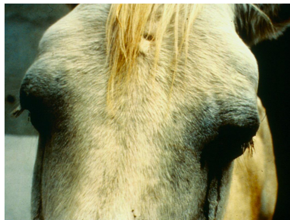
Figure 3 Horse exhibiting oedema of the supraorbital fossae.

The principal vector of AHSV is the female midge of the genus Culicoides (Diptera: Ceratopogonidae). These insects are important vectors of a number of viral diseases worldwide including: Akabane, Bovine ephemeral fever, Bluetongue, Epizootic haemorrhagic disease, Equine encephalosis, Oropouche, and The Palyams [1,35]. It was first discovered that adult females from the genus Culicoides were the principal vector for AHSV in 1944 [36]. Today there are approximately 1,340 recognised species of Culicoides worldwide, of which 96% are obligate bloodsuckers [37]. Typically, Culicoides spp. measure between 1–3 mm, making them amongst the smallest haematophagous flies in the world, and they are currently found on all