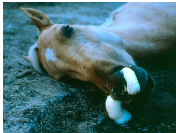
Figure 2 Horse suffering from severe respiratory distress.

There is no mortality associated with this form of the disease [13].