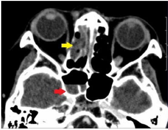
Figure 3 Contrast-enhanced computed tomography of the brain, orbit, and paranasal sinuses.

Notes: This image showed mucosal thickening of the right ethmoidal sinus (yellow arrow) and fluid in the right sphenoidal sinus (red arrow), compatible with sinusitis.