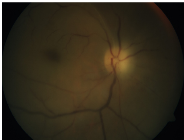
Figure 1 Fundus photo of the right eye showed a slightly pale optic disc, a generalized pale retina, and the presence of a cherry red spot at the posterior pole.

The visual acuity in the right eye included no perception of light, with the presence of relative afferent pupillary defect in the affected eye. Anterior segment examination was unremarkable in both eyes. Fundoscopy revealed a slightly pale optic disc, a generalized pale retina, and the presence of a cherry red spot at the posterior pole, suggestive of CRAO of the right eye (Figure 1).