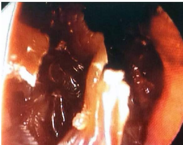
Figure 4 Black eschar seen in the right nasal sinus through sinus endoscopy.

ROCM following tooth extraction has been reported in the literature. 6,7 Following tooth extraction, the extraction socket acts as a port for the spread of mucormycosis from the oral cavity into the palate and sinuses. 6 This pathogenesis contradicts the usual route of infection, which begins in the nose and paranasal sinuses from the inhalation of fungal