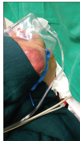
Figure 1: Large mass arising from the right cheek and upper jaw

In the preoperative assessment, there was no significant past medical and surgical history. On airway examination, there was a right cheek lesion with no mouth opening. The tumor involved both eyes and obscured right nostril completely, but the left nostril was patent. We discussed with patient, family, and surgical team about an alternative technique for procedure that does not require airway handling. We also explained awake fiberoptic intubation but its complications or failure may result in tracheostomy. We also did explain that there may be mild pain at certain step during the procedure can be treated.