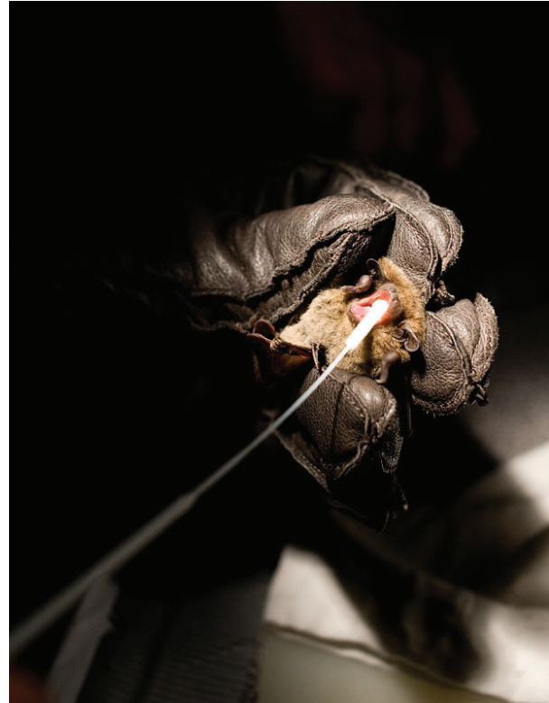
Fig. 2. Sampling of a Daubenton's bat. Saliva specimens were collected by a flocked swab.

The samples containing oral swabs and transport medium were vortexed and incubated at room temperature for 15 min prior to extraction. The extractions were performed by using the commercial kit QIAamp Viral RNA Mini Kit (Qiagen) according to the manufacturer's