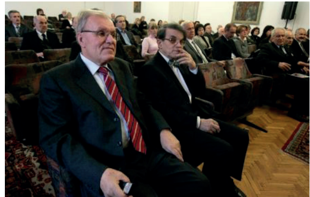
Figure 1. Founding of AMNuBiH at Rectorate of UNSA, Dec 28th, 2009

They continue to report on a daily basis about whether governments and their ministries are or have not been formed, what their representatives are doing and having a good time, murders, migrants, football players (perhaps the most) and similar, much less important events at our region. And our universities and their faculties are in the last place in the ranking of science and education, or they are not ranked at all. Compared to population in BiH, we are far ahead in number of scientific researches of the more developed countries. Unfortunately, this is our reality, the consequences of which will be fatal for us, not just us, but for generations to come."