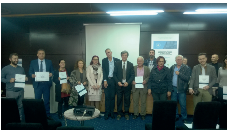
Figure 6. Participants of the Seminar "How to avoid errors in statistical research"

itors of the biomedical journals and also, distinguished professors and scientists who are interesting in the field of Science editing and publishing: Medical Archives, Acta Informatica Medica, Materia Socio-Medica, Croatian Medical Journal, Psichiatria Danubina, Macedonian Journal of Medical Sciences, Medicinski Glasnik, Acta Medica Saliniana, European Journal for Biomedical Informatics, Journal of Perinatal Medicine, Donald School Journal of Ultrasound in Obstetrics and Gynecology, etc. from several counties: Bosnia and Herzegovina, Croatia, Serbia, Republic of Macedonia and USA. The aim of the meeting was to provide fundamental help to PhD students in their PhD thesis, because we all expected that their current topics in the field of scientific publishing will at least be a road sign, how to act, and what to avoid problems in this field.