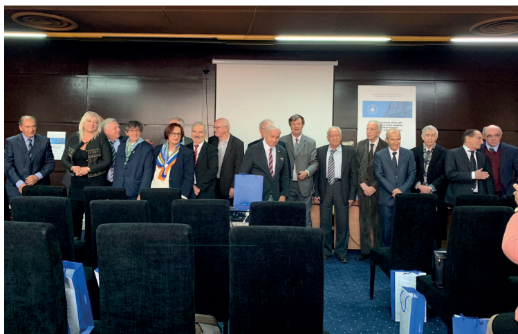
Figure 5. Academicians of AMNuBiH at celebration of 10th Anniversary, 2009-2019

During “Days of AMNuBiH 2018” held in hotel Holiday in Sarajevo on December 8th, 2018 Board of Academy of Medical sciences of Bosnia and Herzegovina organized the “Second SWEP – Mediterranean Seminar about Science Editing and Publishing” - “SWEP 2018”, with participation of 15 editors of important indexed biomedical journals published in countries of South-Eastern Europe. At “SWEP 2018”, active participation have taken by ed-