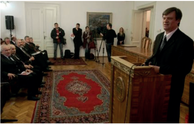
Figure 1. Founding of AMNuBiH at Rectorate of UNSA, Dec 28th, 2009