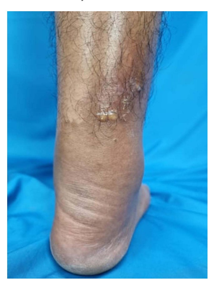
Figure 1 Clinical image of skin lesions before treatments. Multiple brownies erythematous macules with bullae and crusts on the edematous right lower leg.

Upon physical examination, cutaneous edema was observed on the right lower leg alongside multiple brownish erythematous macules measuring 10 × 6 cm. The lesions exhibited no warmth, hardness, or pain. Surrounding the brown erythematous macules, numerous areas showed bullae and crusts ranging from 0.5 \times 0.5 \times 0.1 cm to 1.2 \times 1.2 \times 0.5 cm in size (Figure 1). Direct microscopic examination of hypopyon bullae fluid using Gram staining revealed a large number of polymorphonuclear (PMN) leukocytes (PMN > 10/large view) and the presence of Gram-positive cocci bacteria. Furthermore, a biopsy was performed on a skin lesion on the right lower leg. Histopathological features revealed no alterations to the epidermis, but there was extensive infiltration of eosinophilic inflammatory cells from the dermal papillae to the subcutaneous fat layer, in addition to perivascular infiltration and interstitial infiltration, including eosinophilic infiltration around the adnexa, some displaying flame figures, indicating Wells' syndrome (Figure 2). A peripheral blood smear was conducted and showed leukocytosis (19.300/uL) with a significant predominance of eosinophils (57%). Strongyloidiasis was confirmed by the identification of S. stercoralis in a stool culture (Figure 3). The