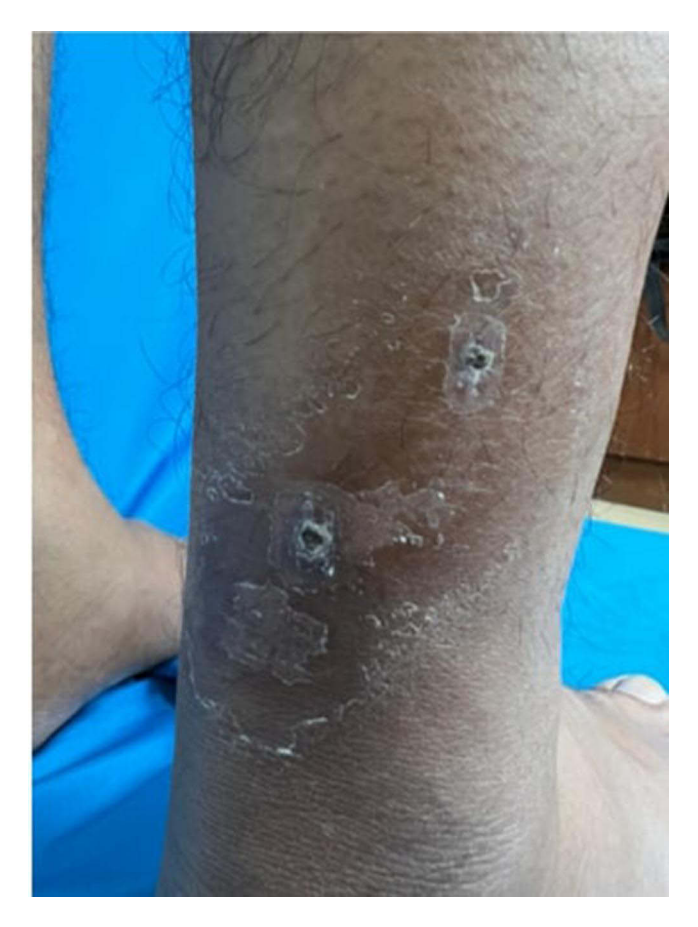
Figure 4 Clinical image of skin lesions after treatments. Hyperpigmented macules with scales on the right lower leg.

treatment, the skin lesions on the right lower leg began to dry out and darken, appearing as hyperpigmented macules with scales (Figure 4). Follow-up laboratory examination results showed improvements and the clinical condition continued to improve throughout the course of the albendazole treatment, with no recurrences observed within 29 days.