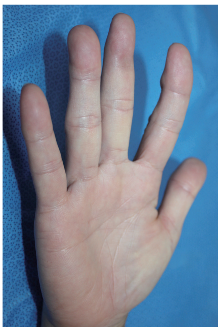
Fig. 4. Case 1: clinical photograph (motion)

Slight depression in the previous defect site was observed on the volar side of the right third finger.