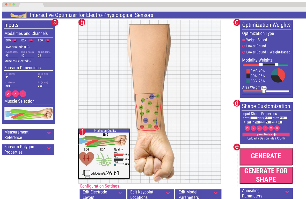
Fig. 2 Screenshot of the graphical design tool for interactively generating and inspecting optimized results. a Input panel for selecting the modalities and muscles, setting forearm dimensions and setting the lower bounds. b The canvas area where the generated designs are visualized. Designs can be fine-tuned by drawing a desired location and shape or dragging individual electrodes. c Panel for choosing the optimization type, weights for each of the modalities, and overall sensor area. d Shape customization panel for fine-tuning the properties related to the sensor shape. Additionally, this panel also allows for uploading existing designs and exporting the current designs. e Buttons for one-click automatic generation of the layout. The result is displayed in real-time in the canvas area. f Panel visualizing quality metrics for the generated layout. Advanced functionality for use by experts can be accessed through drop-down panels. This includes functions for adjusting and editing the electrodes in the generated solution, adjusting the internal parameters of the model, tweaking the optimization parameters, and adjusting the appearance of the forearm polygon. The workflow for using the tool is shown in Supplementary tool is shown in Supplementary Video 1.

To allow for real-time visual analysis of the result’s quality, the design is immediately visualized within a few seconds, alongside metrics for the predicted quality of the sensor (Fig. 2b, f). If the design is not fully satisfactory yet, parameters can be fine-tuned and the design re-optimized. Moreover, a basic electrode layout editor has been incorporated, which enables the user to directly adjust the electrode positions if desired. The resultant quality metrics are immediately updated. These features are vital to enable a designer in-the-loop optimization 32,33 approach: rather than simply accepting the solutions generated by the optimizer, the designer interacts in real-time with the optimizer; this allows for combining the strengths of algorithmic optimization with human creativity and knowledge of the application domain.