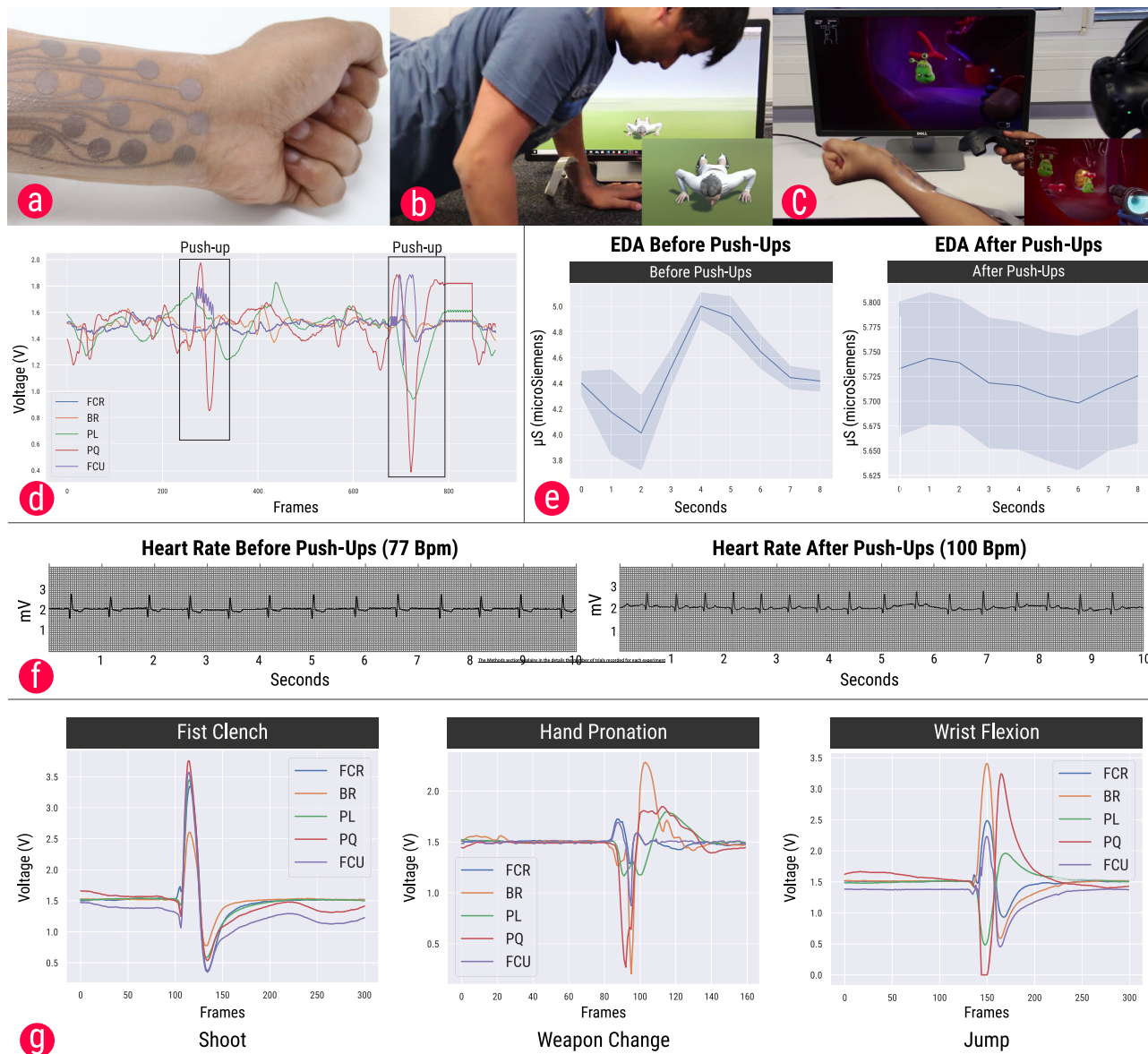
Fig. 4 Example applications. a Ultra-thin temporary tattoo with compact sensor layout generated by the optimizer and fabricated with an off-the-shelf desktop inkjet printer. b Augmented reality exercising application: a virtual character performs push-up motion when the user performs a push-up. c A virtual reality game in which EMG-sensed gestures are used for controlling the virtual character in a first-person shooter game. d Raw signals of the EMG signals when performing a push-up exercise. e Increase in the skin conductivity levels before and after the push-ups. The shaded region represents the standard deviation. f Difference in the heart rate before and after performing the push-ups. g Raw EMG signals of the five muscles for each of the gestures used in the virtual reality game.

found in skin conductance levels on the forearm as reported in prior work 15 . For ECG, the difference in the predicted and measured values for the AREA OPTIMIZED and EXPERT GENERATED designs was very small as well (1.1% and 0.3%, respectively). It should also be noted that, although the quality of ECG signals drops drastically near the wrist, the distinct QRS peaks can still be noticed, implying the signal can be used for measuring the beats per minute (BPM) or heart rate variability (HRV) (Fig. 4e).