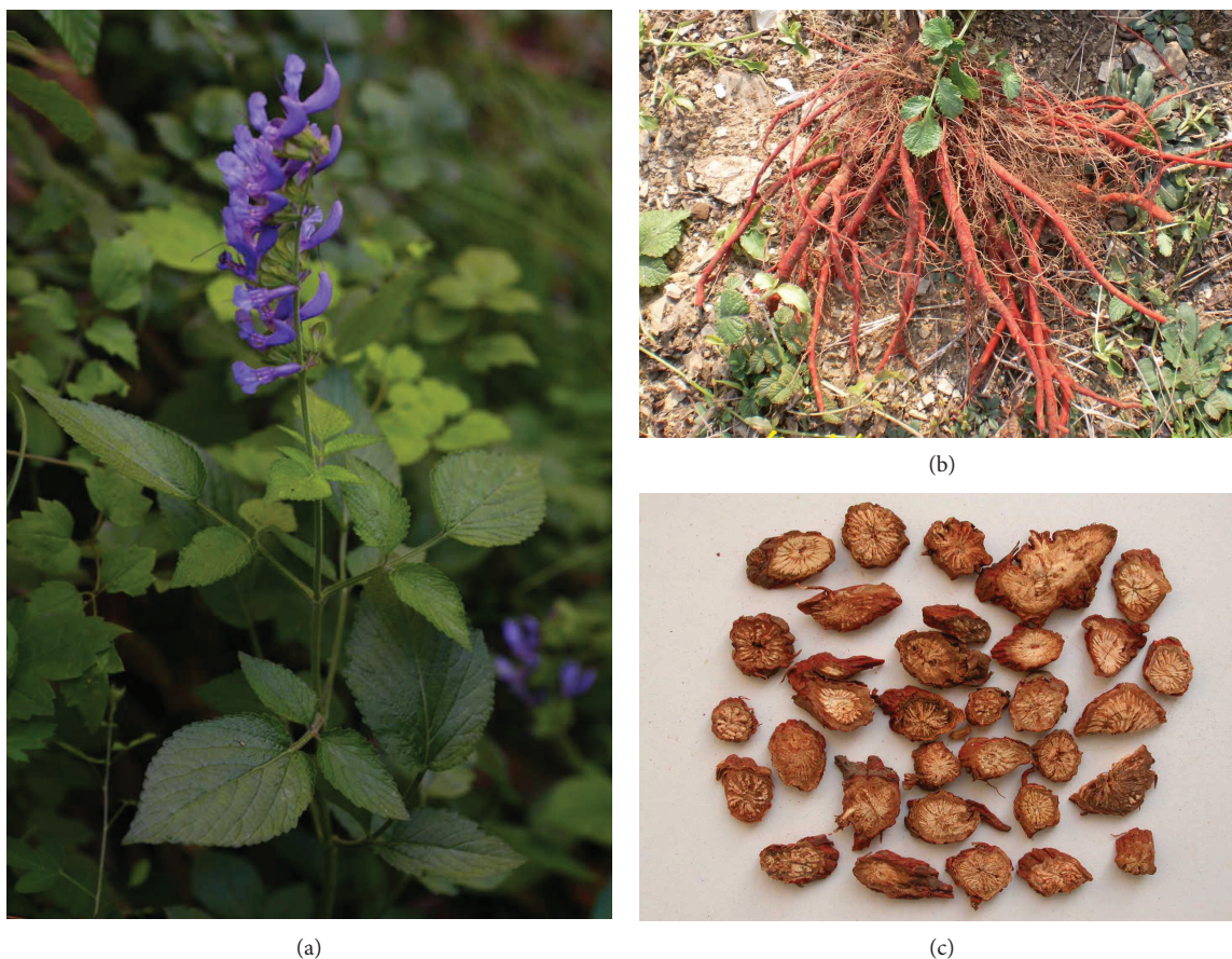
FIGURE 2: Pictures of Salvia miltiorrhiza and Salviae Miltiorrhizae Radix et Rhizoma : (a) the whole plant of S. miltiorrhiza ; (b) the roots of S. miltiorrhiza ; and (c) medicinal materials of SMRR used in TCM.

cytoprotective genes, and activates their transcription. These ARE-containing genes are mainly divided into three groups: (i) intracellular redox-balancing proteins, including \gamma -glutamyl cysteine synthetase ( \gamma -GCS), thioredoxin reductase (TrxR), and heme oxygenase-1 (HO-1) that maintain the cellular redox capacity and eliminate ROS; (ii) phase II detoxifying enzymes, exemplified by NAD(P)H: quinone oxidoreductase 1 (NQO1) and glutathione S-transferase (GST), which promote excretion of toxicants; and (iii) xenobiotic transporters: multidrug resistance-associated protein (MRP) [9, 32]. The schematic model of the Nrf2 pathway is shown in Figure 1. Based on the biological functions of these genes, the activation of Nrf2-mediated defensive response efficiently counteracts oxidative insults.