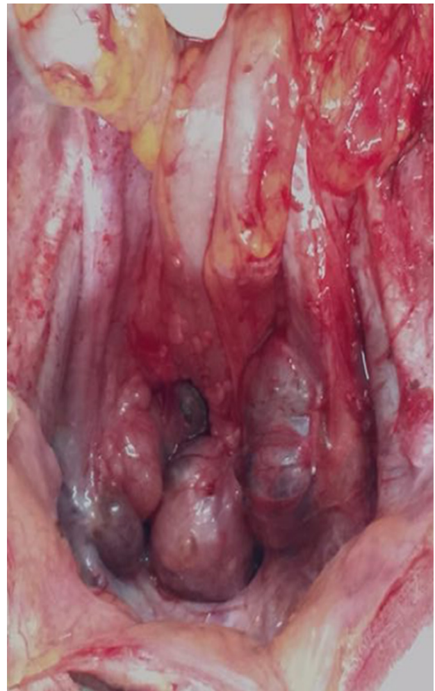
Figure 2 The operative findings including cystic and solid masses in the uterus-rectum-fossa.

Traditionally, ependymomas are thought to originate from the neuroectodermal tissue, most commonly from the spinal tissue or in the cranium. However, in rare circumstances,