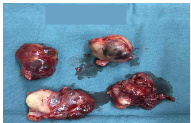
Figure 3 The resected masses.

these tumors can proliferate outside the central nervous system. It has been hypothesized that ependymomas in the pelvis can arise from the pluripotent stem cells of Mullerian origin or from an established ovarian teratoma. 1