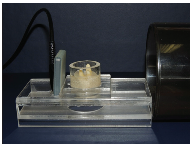
Figure 1: Plexiglas cylinder containing a centrally positioned specimen with the apices facing upward. The cylinder is fixed onto a prefabricated plexiglas mount to standardize radiographic documentation

Radiographic measurements of canal curvature were carried out by an independent examiner blinded to the experimental design and study objectives. Intraobserver