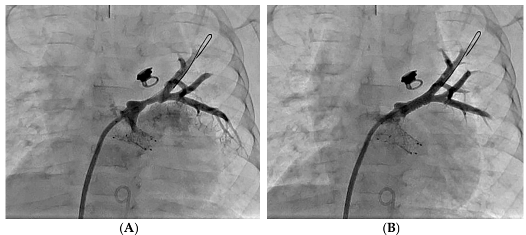
Figure 2. (A): Retrograde venography of the left upper pulmonary vein demonstrates proximal stenosis. (B): Follow up venography following stent implantation demonstrates improved caliber of the left upper pulmonary vein.

At our center, retrograde venography (Figure 2) in all affected veins is performed to identify stenosis and evaluate upstream arborization. Retrograde venography is performed via a transeptal approach. A large guide catheter (Judkins Right, typically) or Mullins long sheath is advanced to the ostium of the pulmonary vein, and a rapid, low-volume hand injection performed. This retrograde angiogram provides not only detail of the pulmonary vein ostium, but also details of the upstream segmental and subsegmental venous vascular bed.