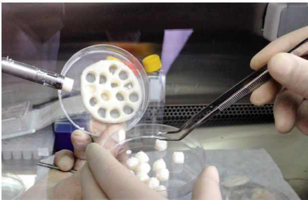
FIGURE 1. Preparation of standard 10×10 mm bone cement samples.

in the center of the wells and left for incubation for 24 hours at 37°C under 5% CO 2 (Figure 3). Whatman paper (Whatman Ltd., Maidstone, Kent, UK) soaked in DMSO was used for negative control and DMEM for positive control. At the end of 24 hours, the vital stain of neutral red was dropped into the wells and cytotoxicity was determined with examination using the inverted microscope. The viability rates of the cells were identified according to the scale recommended by Ergün et al. [11] (Table II).