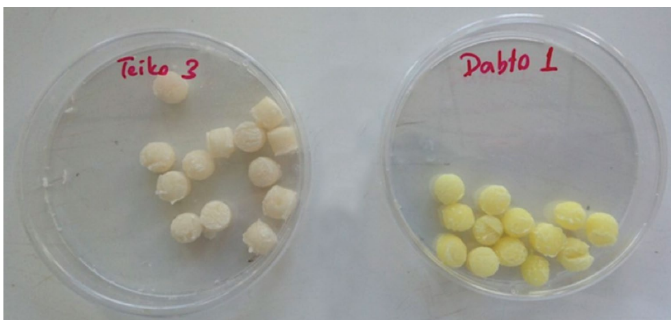
FIGURE 2. Standard samples at 10 mm diameter with different doses of antibiotics added.

For scanning electron microscope (SEM) investigation, paired samples of the control group and investigation material were used. The material was placed on 24-well plates, and each well had fibroblast culture of 3 \times 10^4 cells added. The plates were then incubated for 24 and 72 hours at 37°C in a 100% humid environment. During the incubation period, the medium was not changed. At the end of the 24- and 72-hour incubation periods, 0.1%